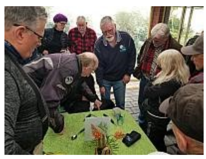
Stop and Go tyre repair method demonstrated .