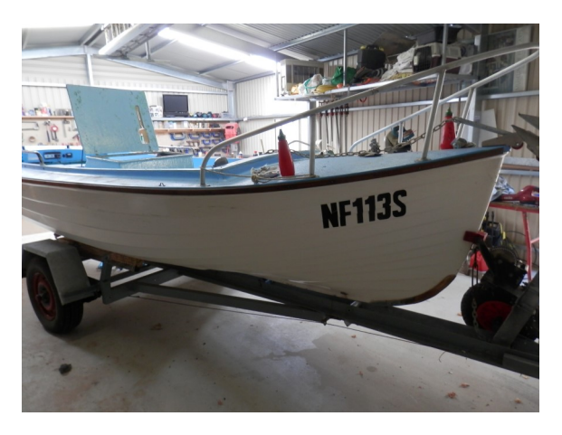
Recently restored Vintage Boat