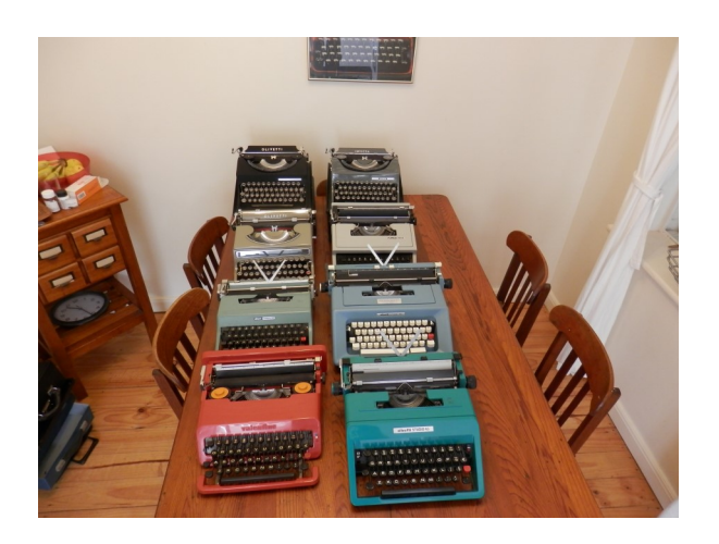
Part of Ray's typewriter collection