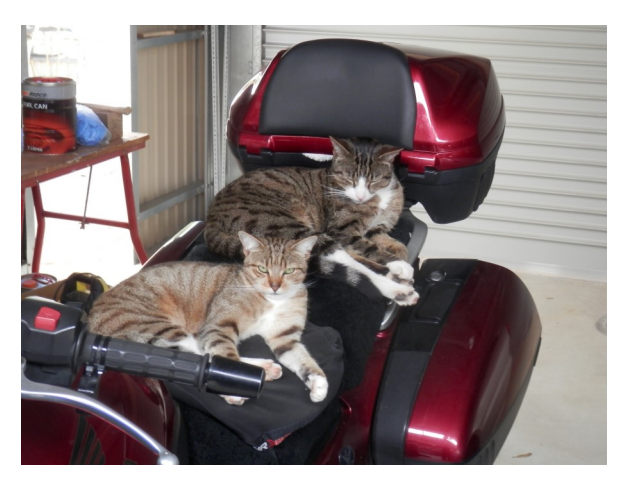
Ray's seat warmers