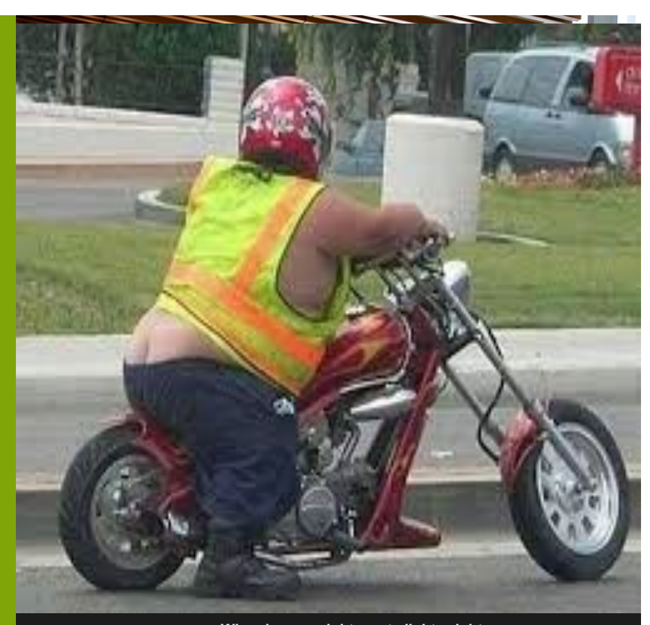
When heavyweight meets lightweight

"Four months' off and five good leads..."