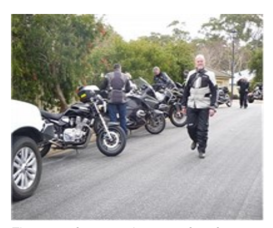
They came from near they came from far.