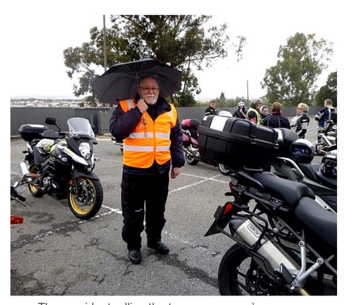
The president rallies the troops - aww c'mon guys.