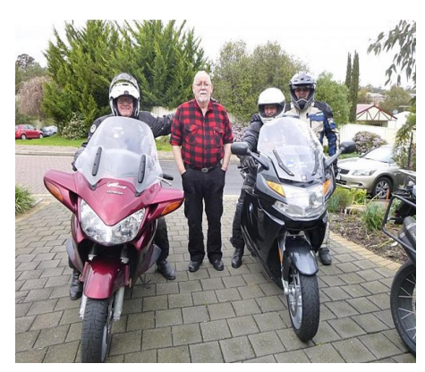
:Leaving as full as a goog